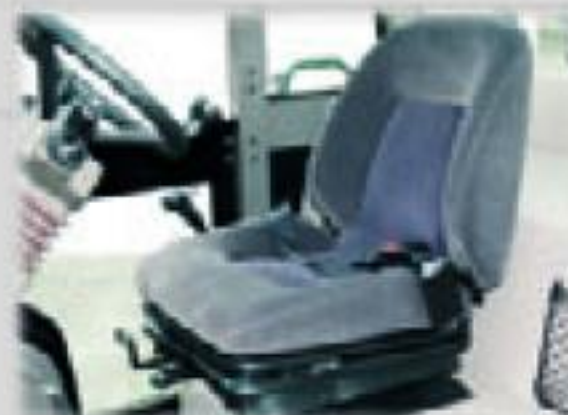
Comfort seat with closed cab